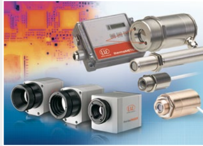
Sensors and measurement devices for non-contact temperature measurement