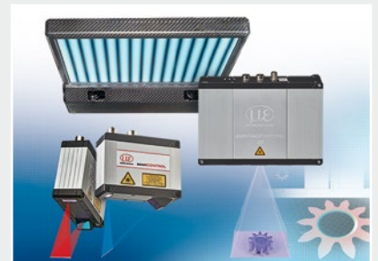
3D measurement technology for dimensional testing and surface inspection