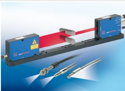
Optical micrometers and fiber optics, measuring and test amplifiers