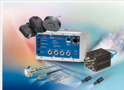
Color recognition sensors, LED analyzers and inline color spectrometers