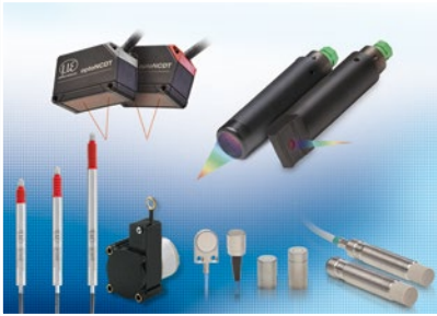
Sensors and systems for displacement, distance and position